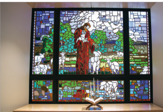
← The stained-glass window was created by Clayton Connolly. The glass portrays Jesus as the Good Shepherd. Jesus is surrounded by nine sheep, representing the division's nine union conferences. Pieter Damsteegt